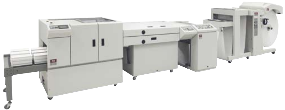
The RS Stack solution includes the RS Unwind, RS Cutter, and RS Merger, with an RS Stacker to match your environment (RSD1 Stacker shown).