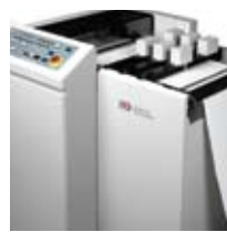
Optional hole punch