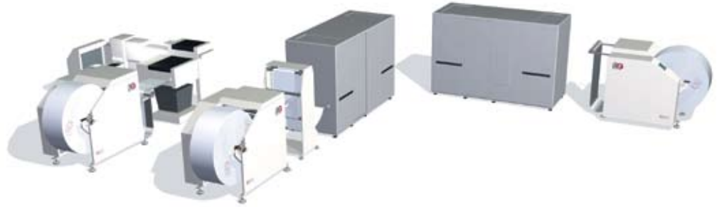
The RS Roll-to-Roll CS solution includes the RS52 Unwind and the RS102 Rewind.