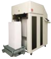
Automatic stack eject.

The surface-driven RS Unwind features no-lift mounting and a self-centering shaftless design and begins by unwinding a web up to 21 inches wide into a digital printer. The RSF5 Folder automatically threads-up the pinless or pinfed paper web, and automatically adjusts for varying form lengths – no gear change is required.