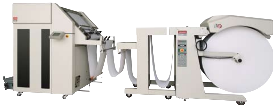
The RS Fanfold HS solution includes the RS Unwind and RSF5 Folder.