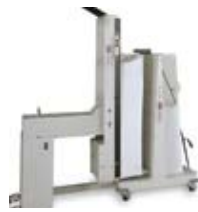
Tilt and load StackRack.

All components are modular, compact and are designed to dramatically improve workflow.