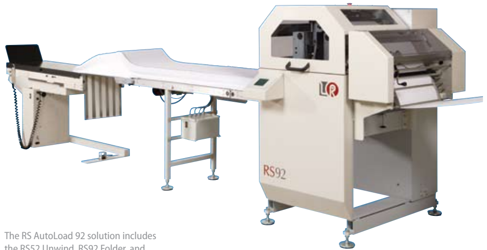
The RS AutoLoad 92 solution includes the RS52 Unwind, RS92 Folder, and RST3 AutoLoad Tilt Table.