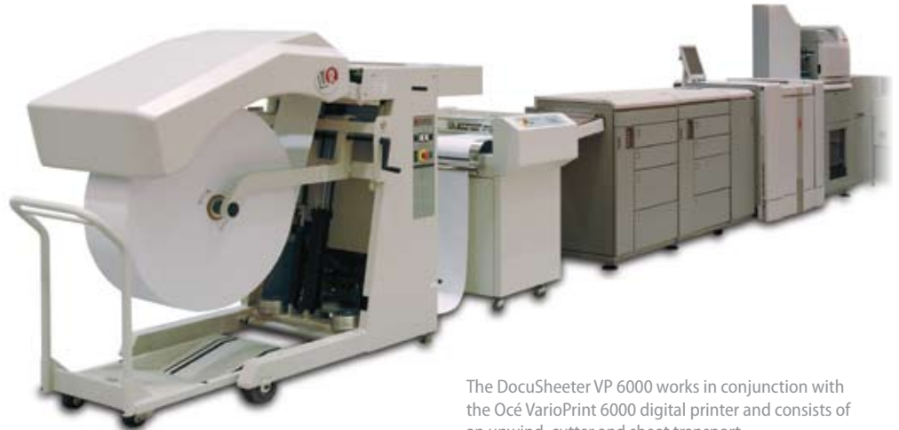
The DocuSheeter VP 6000 works in conjunction with the Océ VarioPrint 6000 digital printer and consists of an unwind, cutter and sheet transport.