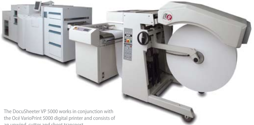
The DocuSheeter VP 5000 works in conjunction with the Océ VarioPrint 5000 digital printer and consists of an unwind, cutter and sheet transport.