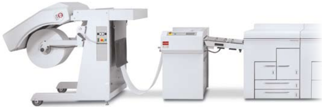
The DocuSheeter NV feeds sheets to the Xerox Nuvera, and comprises an unwind, cutter and sheet transport.